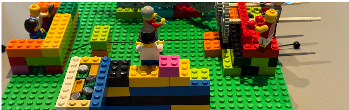
Example of models from a previous workshop

This exercise often brings surprises, both for the individual and for the group. Challenges that have never been put into words suddenly become visible.